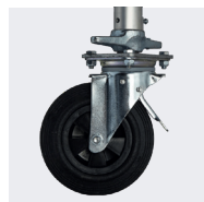
Wheels Ø 200 mm adjustable over 175 mm up to 12.5 increments