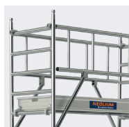
Advanced guardrail system with diagonals