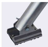
Anti-slip and swivelling stabilizers