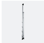
Maximum safety No risk of tipping over forward