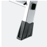
Non-slip moulded footpads Ref. 9728