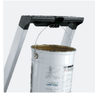
Bucket hook. Max. weight 1 kg