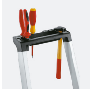
Tool-holder with screw tray.