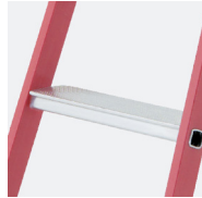
Crimped connection without screws and rivets. Steps 8 mm wide