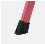
Non-slip moulded footpads Ref. 9763