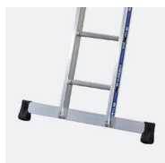
Optional retaining bar (ref. 9612)