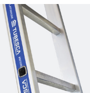
Highly-strength rungs with triple crimp-fitting onto the uprights