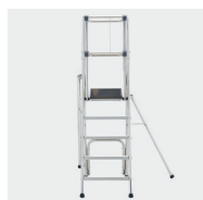
Can be used against a wall