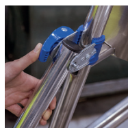
Stabilizers lock with Ergoblock® patented system