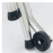
Ø 100 mm wheels