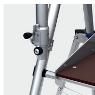
Evolution of guardrail locking system

Delivered in shrink film with POS brochure. The platform is counted as a step. Models 02272512 and 02272513 do not have stabilizers.